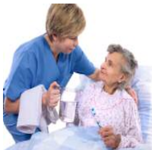
Sitter, Light house keeping,

Pender Adult Services, Inc. now offers assistance in the home for individuals and their families in Pender and Duplin Counties Services include CAP In-Home aide, Personal Care & Private Pay. CALL NOW FOR MORE INFORMATION!