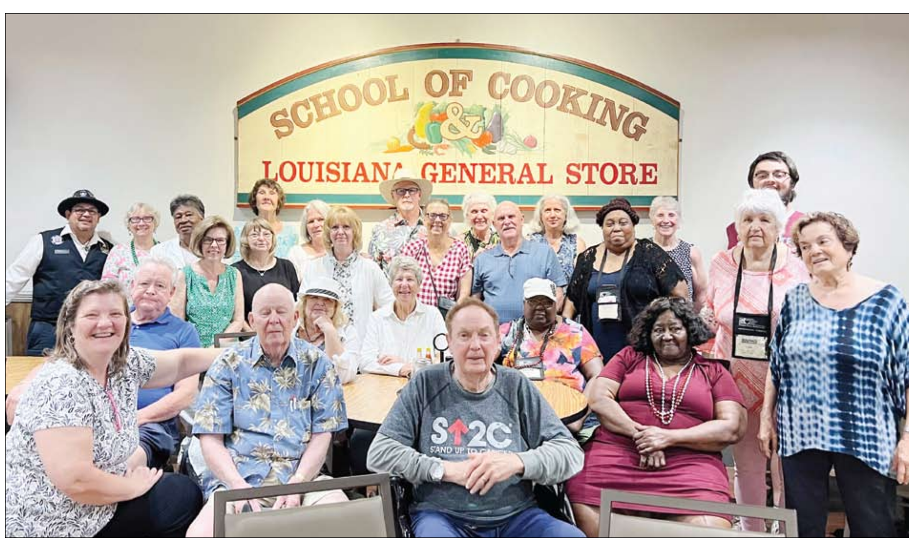
PAS travelers enjoyed a stop and cooking class in New Orleans during their recent trip. The next trip is a holiday excursion to Charleston. See

The center will be closed Monday, Sept. 5 in observance of Labor Day. We wish everyone a happy and safe Labor Day Holiday!